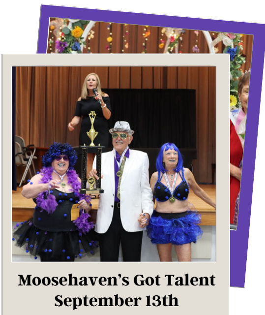
Moosehaven's Got Talent September 13th

Moosehaven is a private retirement community in the heart of Orange Park, Florida.